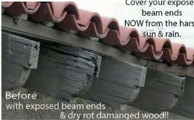
Before with exposed beam ends & dry rot damaged wood!!

Cover your exposed beam ends NOW from the harsh sun & rain.