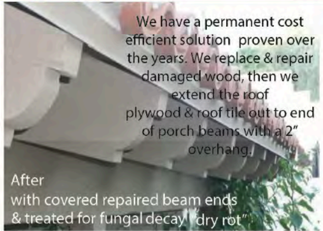
After with covered repaired beam ends & treated for fungal decay "dry rot"

Cover your exposed beam ends NOW from the harsh sun & rain.